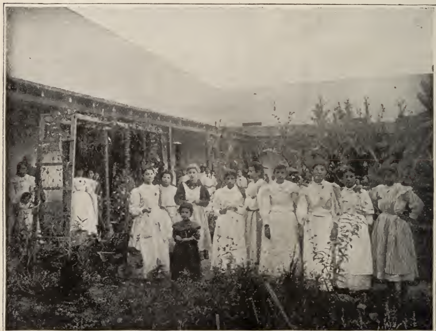
GIRLS' SCHOOL, PRESBYTERIAN MISSION, SALTILLO, MEXICO.